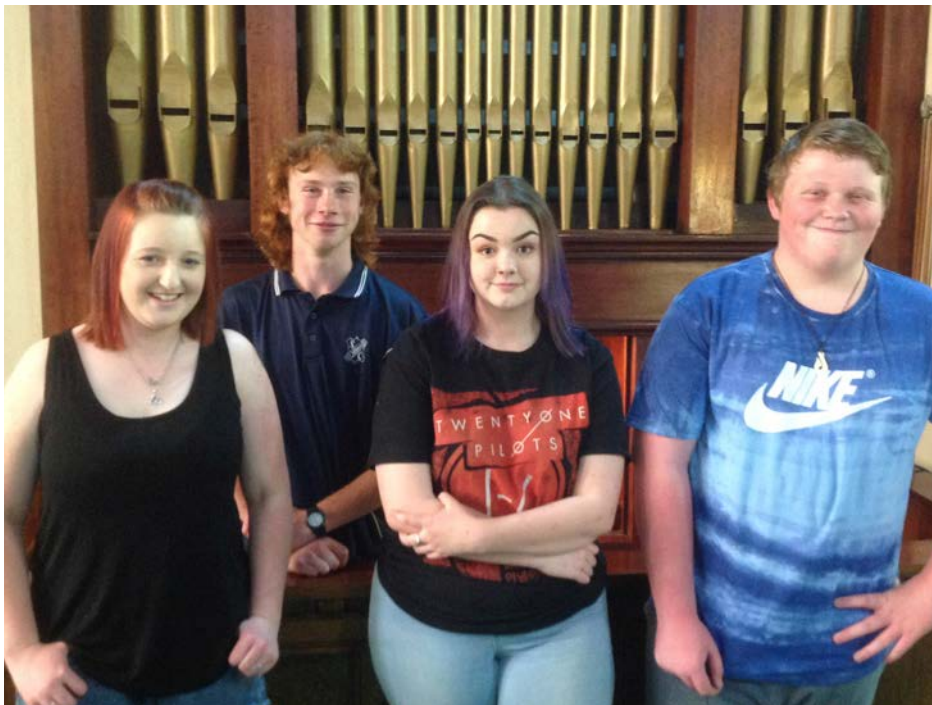
Play: St Arnaud music students visit each year to play the pipe organ