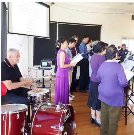
Music: Singing at the Christmas lunch