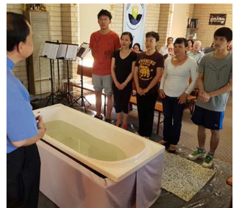
Baptism: The five candidates

Both English and bilingual congregations had a meaningful service as they made a covenant with God and lit up their candles as an act of oneness in Christ - "Let our flame burn brighter".