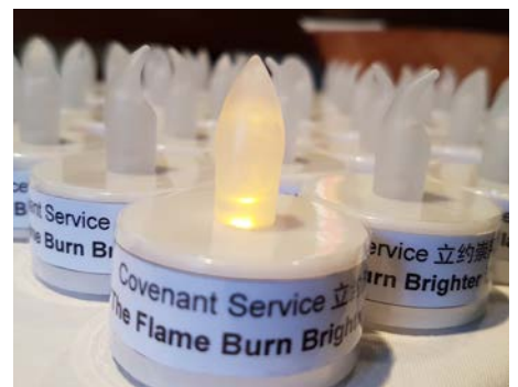
Burn bright: Covenant service