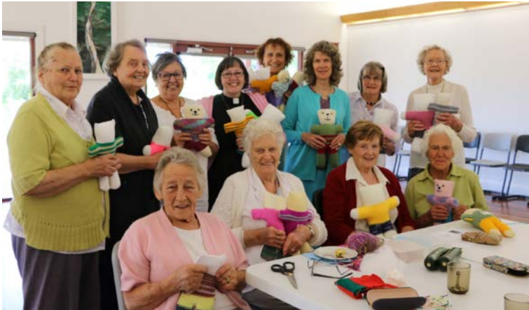
Aid: The Knit and Natter group making the Trauma Teddies

The talented guild members of the Woodend-Trentham parish have teamed up with the local Red Cross to make Trauma Teddies.