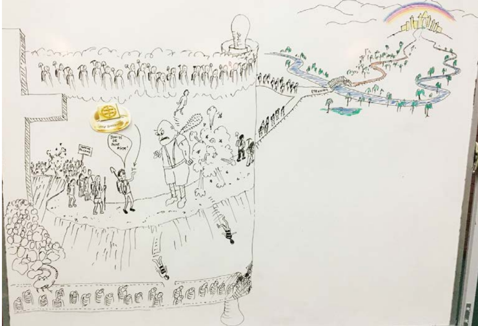
Illustrate: Terry Hunter's drawing of the sermon series 'God's Big Story'