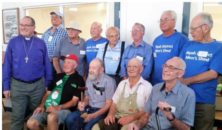
Opened: Nyah West Men's Shed members at the opening