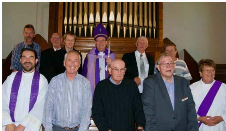
Dedicated: Parishioners with the Fincham pipe organ at Talbot