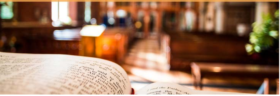
Explore: Join the lectures and general discussion on the New Testament

We welcome you to engage with the richness of the New Testament through a series of evenings run by a team from the Bendigo Diocese. We will follow a set of introductory video lectures which explore the New Testament in its historical, literary and theological contexts, and how these are intertwined. Bring your sense of curiosity and join us for these lectures, guided discussion and more.