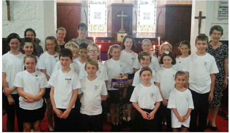
Sing: The Young Voices of Macedon Ranges Choir

The people of St Mary's Woodend were joined by the very talented youngsters from the Young Voices of Macedon Ranges Choir on 26 March.