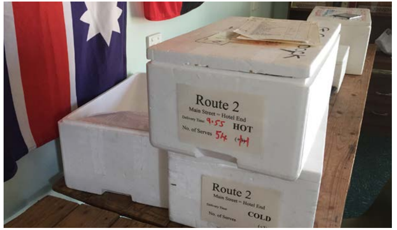
Distribution: The packaged pancakes ready for delivery

Shrove Tuesday dawns with a flurry of activity at Cranmer the Martyr, Cohuna with the first pancakes poured onto the grill at around 6.30am in what will be a marathon event. Pancakes are cooked, packed and stacked, ready for delivery with jam and cream to over 100 businesses in town and for over 100 people at morning tea.