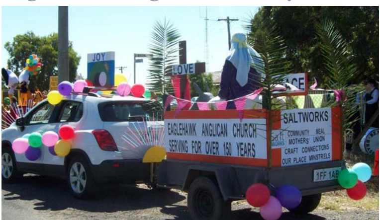
Carnivale: Eaglehawk Anglican Church float at the Festival