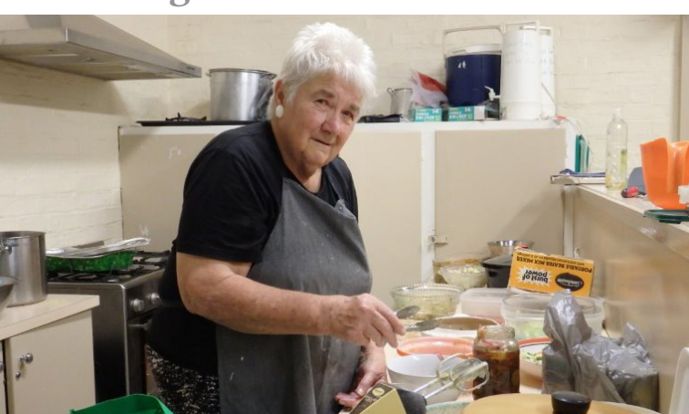
Cooking: Preparing the pancake batter for Shrove Tuesday