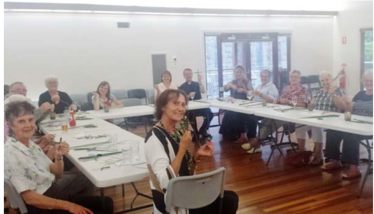
Craft: The parishioners show off their newly made palm crosses