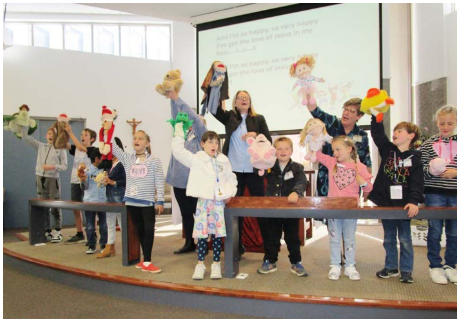
Family church: Hand puppets joined in the singing at the family service