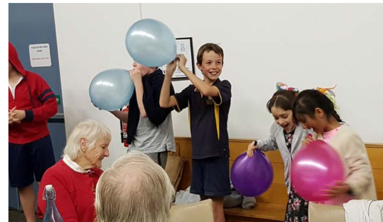
Games: Kids enjoy some novelty games

That was the combination at St Mary's Kangaroo Flat on Friday 10 August. The parish held a 'Curry and Casserole' night and had a great turn out of people coming not only from our congregations but also people from the wider community.