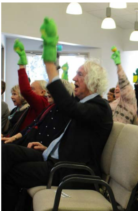
Fun: The congregation join in

Since arriving at the Parish of Kangaroo Flat almost a year ago the 11am service has undergone some changes with the addition of new families with very young children. This