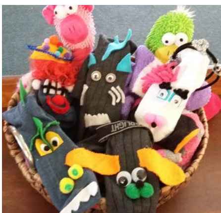
Engage: Sock puppets

Newcomers were welcomed to church with each member of the congregation bringing to life a sock puppet which had been lovingly