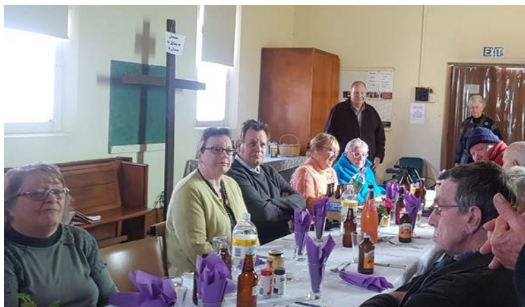
Celebrations: St Arnaud parishioners enjoy a parish lunch

Our town of St Arnaud is named after French Crimean War hero Jacques Leroy de Saint Arnaud. He was championed by the local people who rejected the authorities' choice of 'New Bendigo' as the name for the new Goldfields town. Further investigation reveals that St Arnaud is the French form of St Arnold, the patron saint of Brewers, so we decided it was appropriate to celebrate.