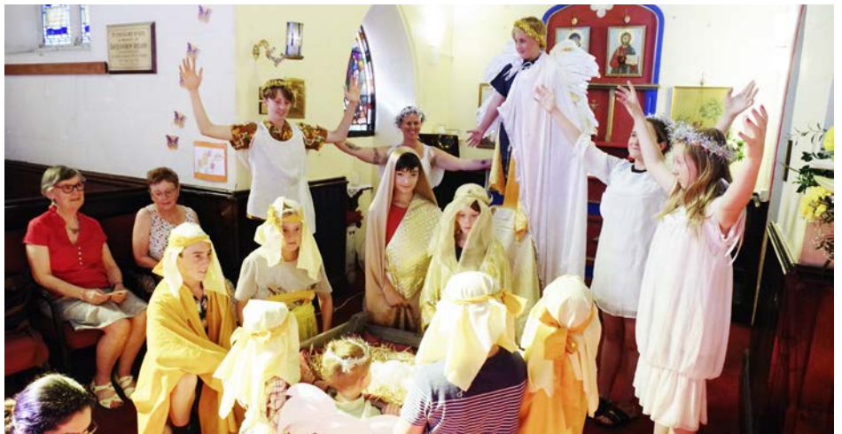
Show: Sharing the Christmas story