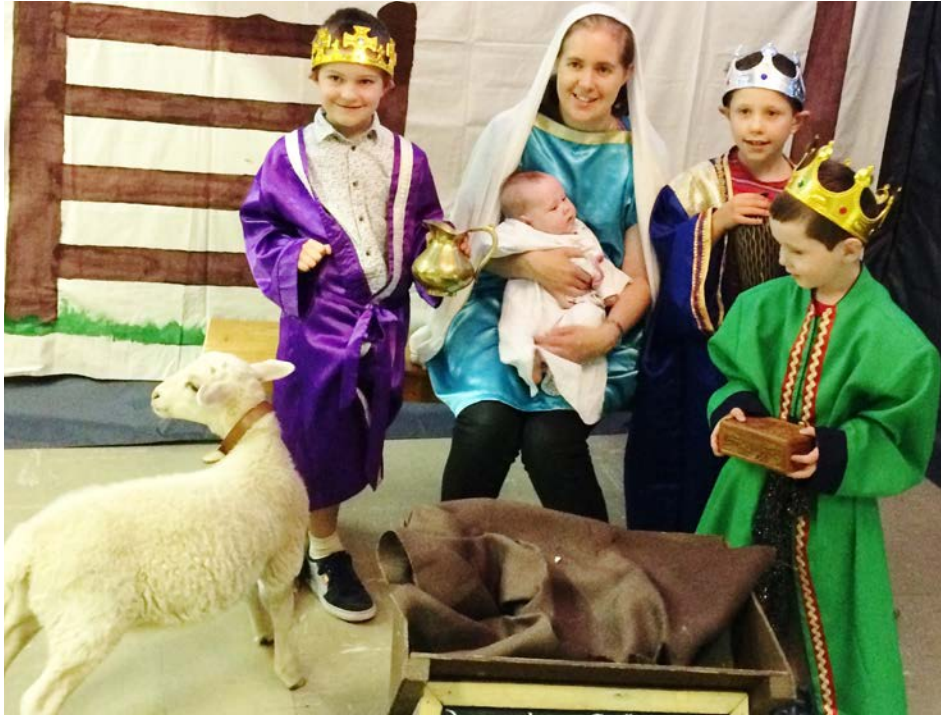
Photobooth: The nativity photobooth at St Alban's, Mooroopna