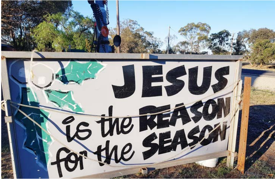
Proclaim: The sign featured at St John's, Bears Lagoon