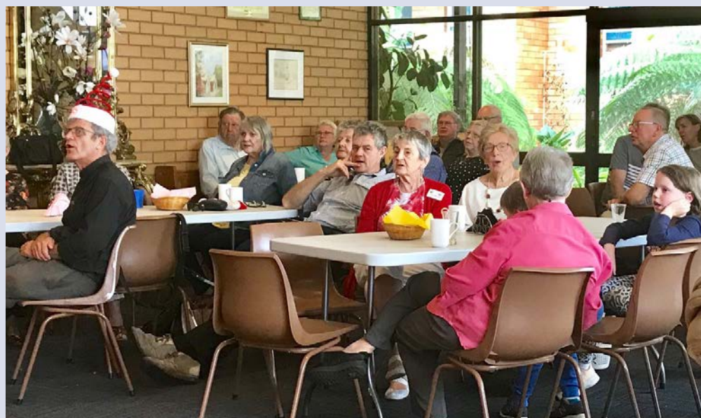
Fellowship: The congregation at the Cafe Church Christmas service in Swan Hill