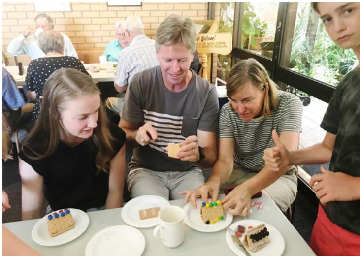
Create: Cafe Church activities enjoyed in Swan Hill