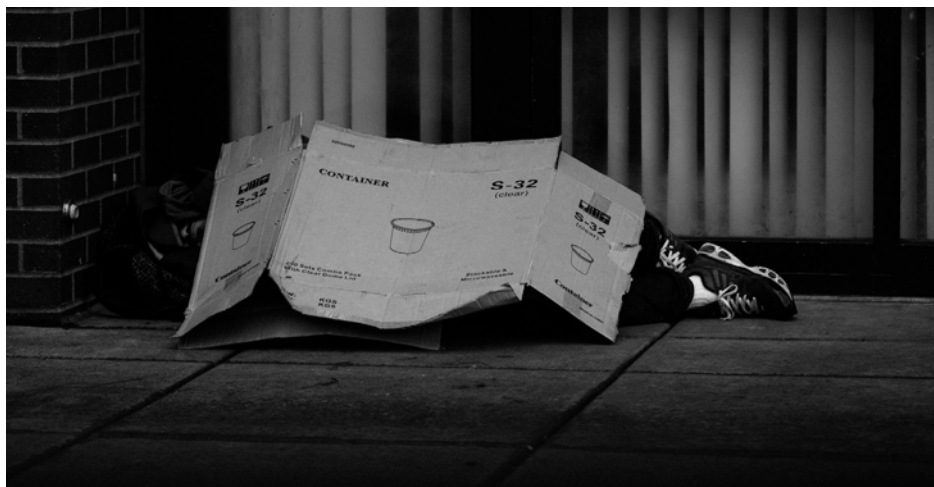
Compassion: Bendigo churches will provide support to the homeless during winter