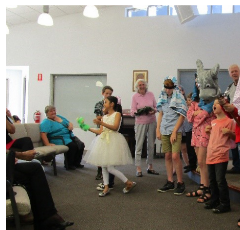
Fun: The congregation joins in the fun

Of course a baby must be appropriately dressed in a nappy to really play the