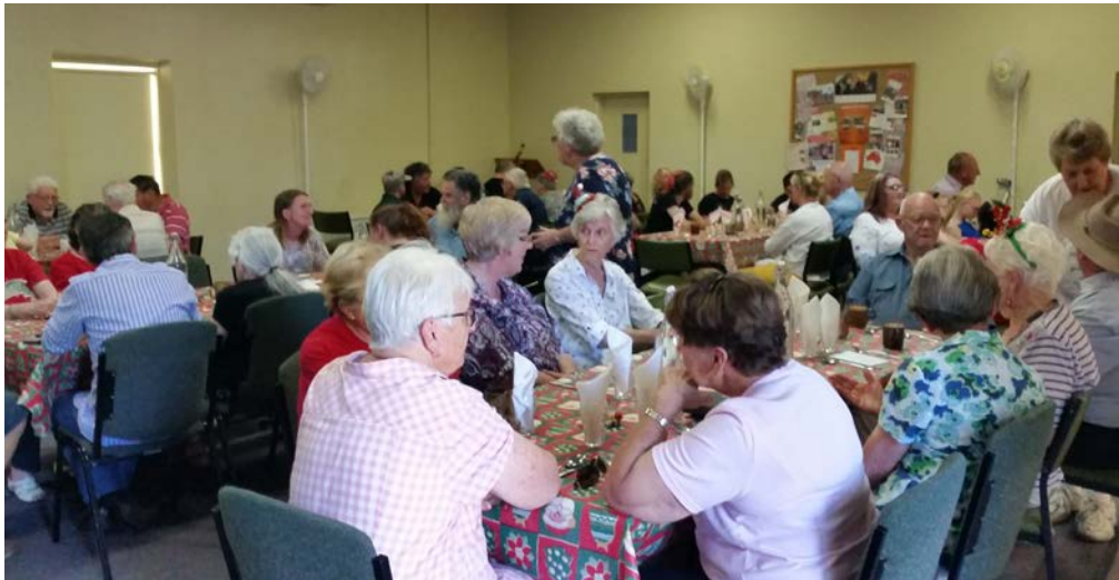
Well fed: Attendees at the Christmas dinner at St Andrew's, Kyabram

On Monday, 10 December 90 clients enjoyed a nutritious two course Christmas dinner including roast pork and vegetables and home made christmas pudding and custard at St Andrews in Kyabram.