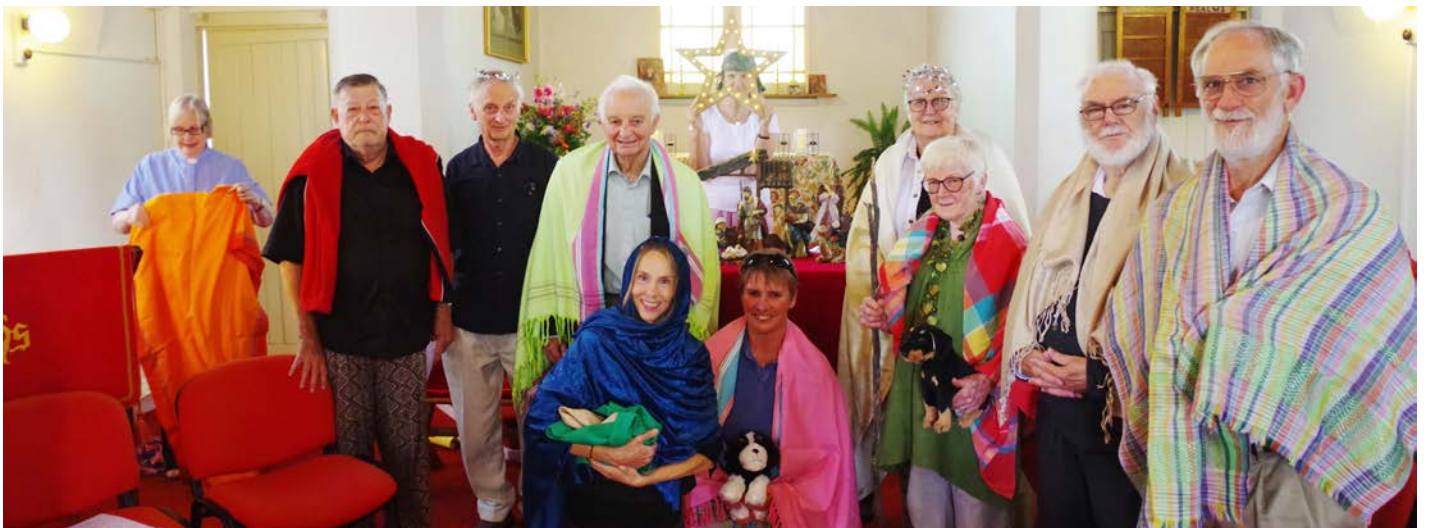
Participate: The congregation at St John's, Chewton telling the Christmas story