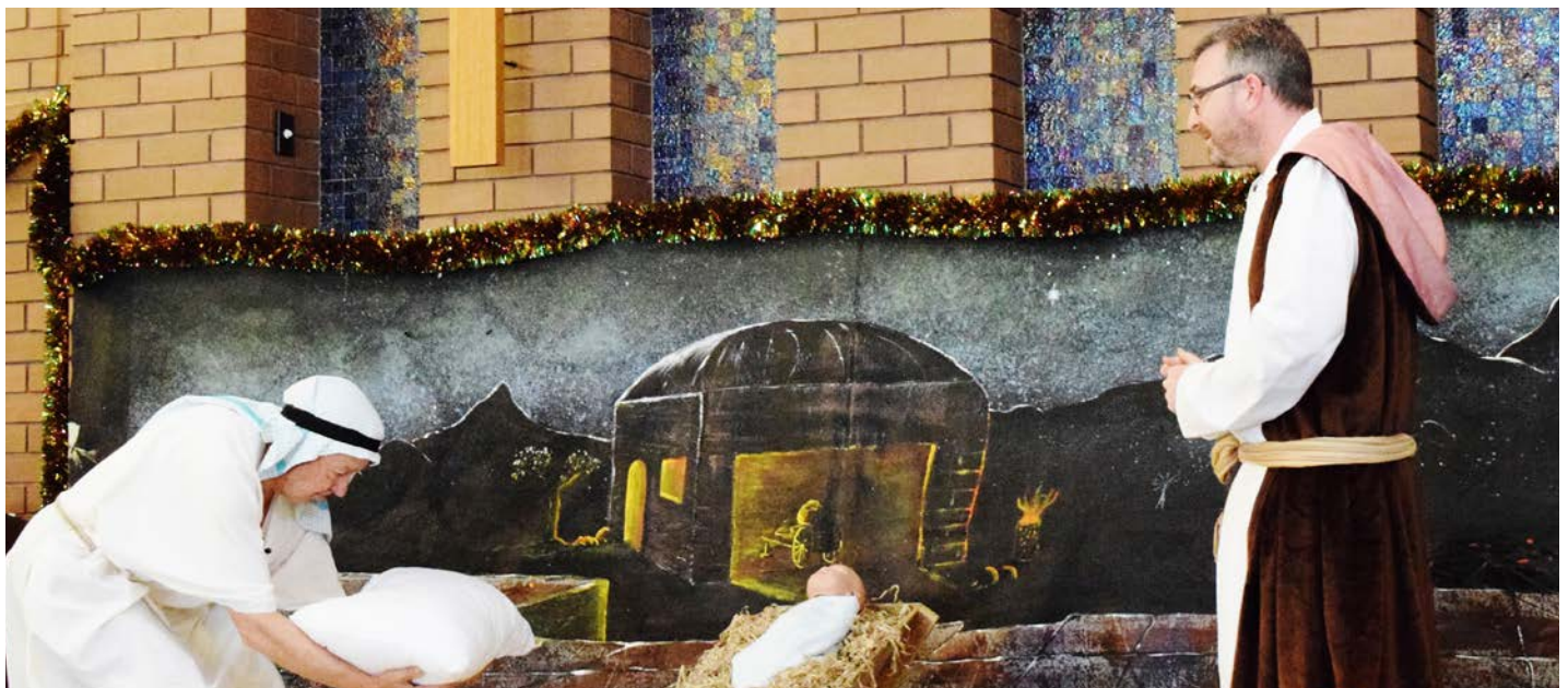
Storytellers: The team at South East Bendigo presented a children's version of the Christmas Story