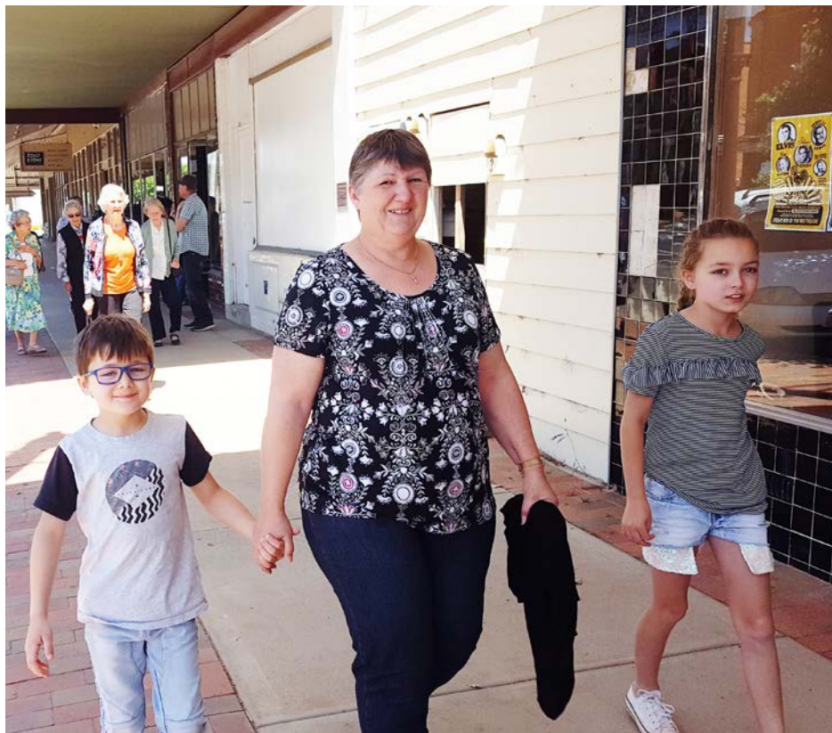
Thankful: Children and families filled the cinema for the free movie afternoon