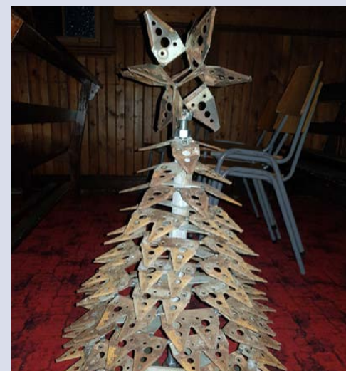
Creative: A clever Christmas creation