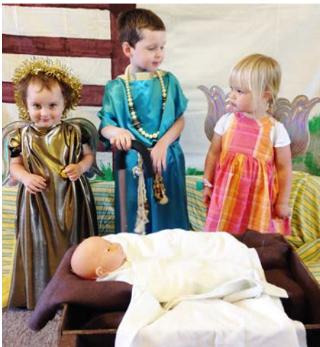
Nativity: Mooroopna's photobooth