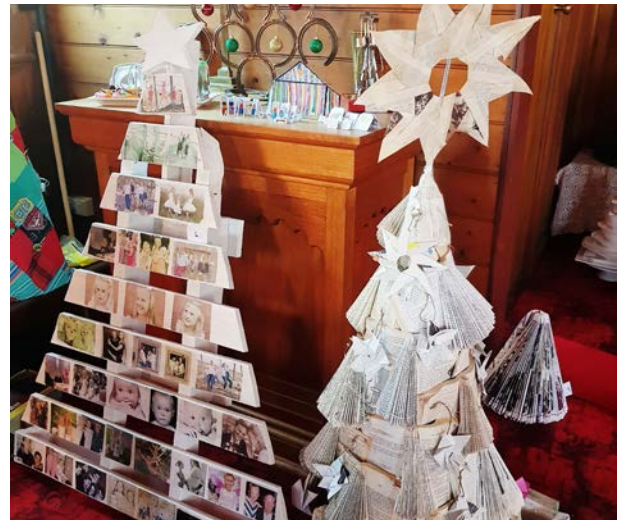
Clever: Creative Christmas Tree entries