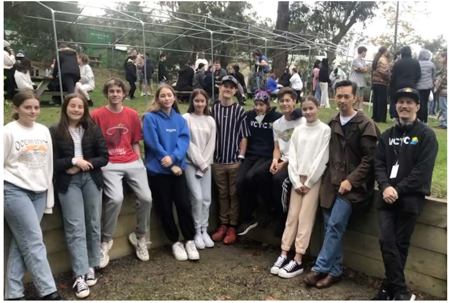
Engage: Young people from the Parish of South East Bendigo attending the Victorian Christian Youth Convention