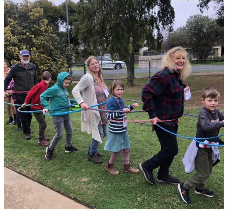
Fun: Adults and kids join in the activities