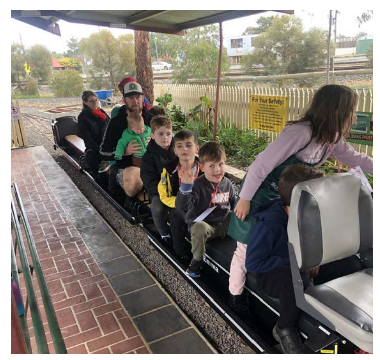
Ride: All aboard the miniature railway in Elmore!

We heartily recommend Scripture Union to other parishes to use for activities with children and teenagers.