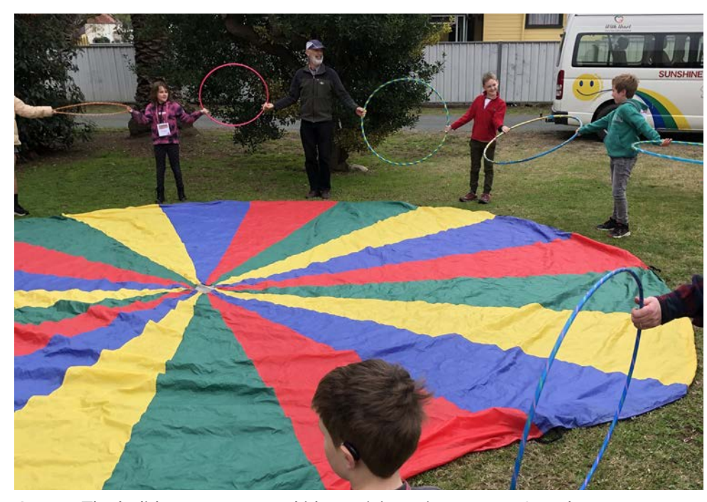
Games: The holiday program saw kids participate in a range of outdoor games

The program was run in conjunction with Scripture Union Victoria using their brand new Restoration Station material. Alongside restoration activities of restoring items such as the Elmore Primary School bell, an old wooden carpenter's box and a copper weather vane, the kids learnt about how Jesus can restore the broken bits that are