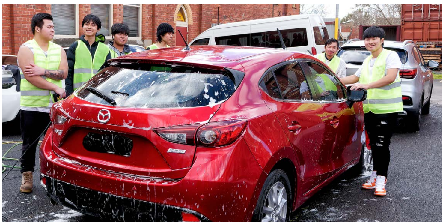
Car wash: A group of young Karen adults give Dale Barclay's car a good wash